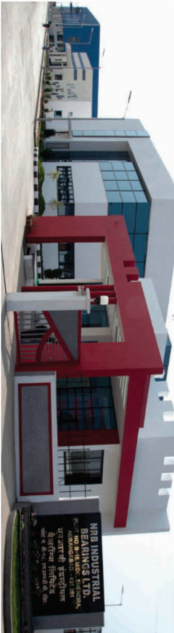
SHENDRA PLANT, AURANGABAD