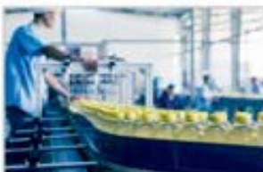
Bottling, Canning & Packaging